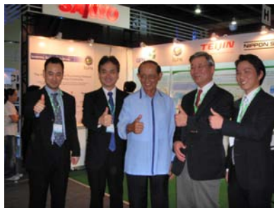
FVR "thumbs -up" for the camera with some Japanese exhibitors.